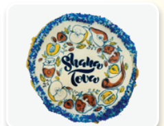
Shana Tova Cookie

To see our full holiday menu and place your order, visit sunflowerbakery.org Questions? Call us at 240-361-3698 or email info@sunflowerbakery.org