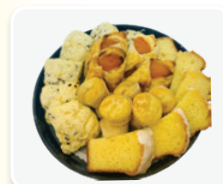
RH Pastry Platter